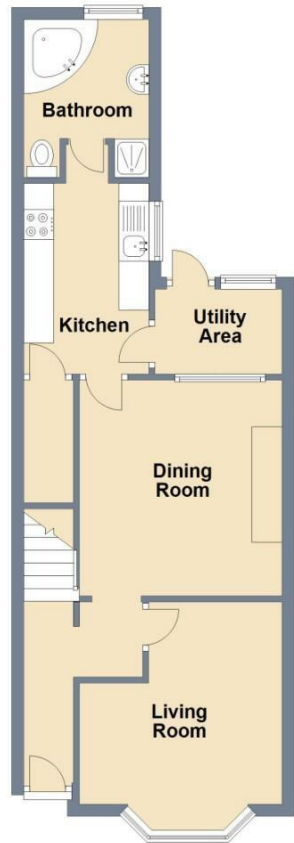
Ground Floor Approx. 46.2 sq. metres (497.5 sq. feet)